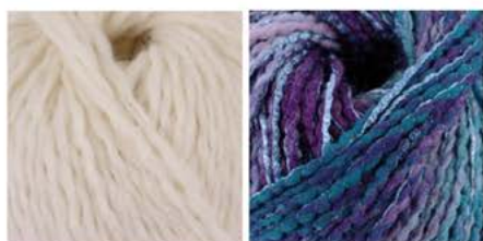
kuki 1 arti 83