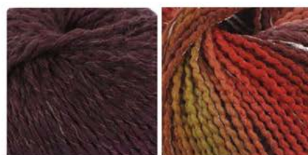
kuki 6 arti 81