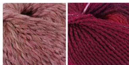
kuki 4 arti 89