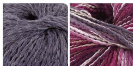
kuki 5 arti 85