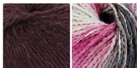
kuki 6 arti 82