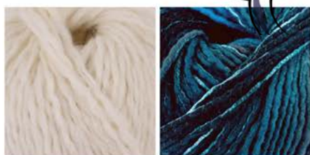
kuki 1 arti 84