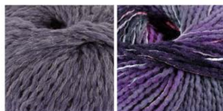
kuki 5 arti 88