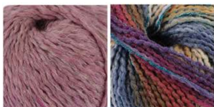
kuki 3 arti 86