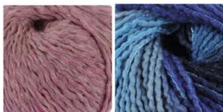
kuki 3 arti 87