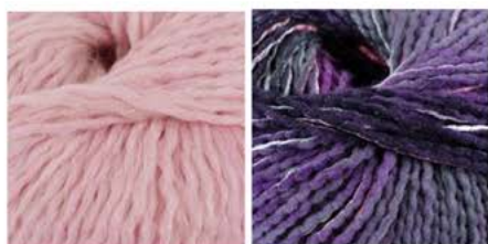
kuki 2 arti 88