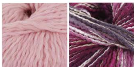
kuki 2 arti 85