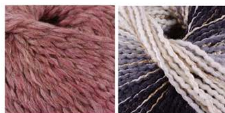
kuki 4 arti 80