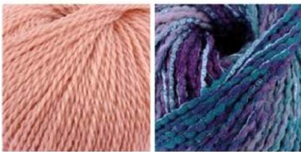
soavia 61 arti 83