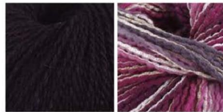
soavia 66 arti 85