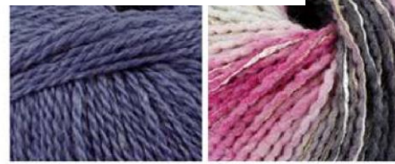
soavia 64 arti 82