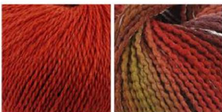
soavia 63 arti 81