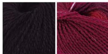
soavia 66 arti 89