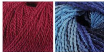
soavia 65 arti 87