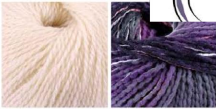
soavia 60 arti 88