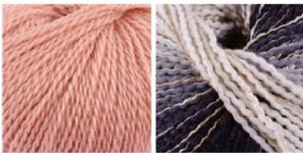
soavia 61 arti 80