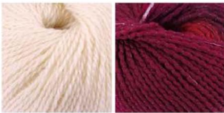
soavia 60 arti 89