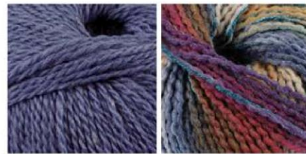
soavia 64 arti 86