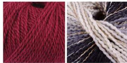
soavia 65 arti 80