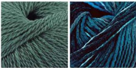
soavia 62 arti 84